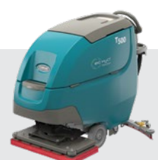
Orbital: 28 in / 700 mm