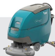
Dual disk: 26 in / 650 mm & 28 in / 700 mm & 32 in / 800 mm