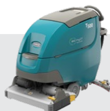
Cylindrical: 28 in / 700 mm

Clean virtually any hard surface condition and maximize your return on investment with a wide range of cleaning heads.